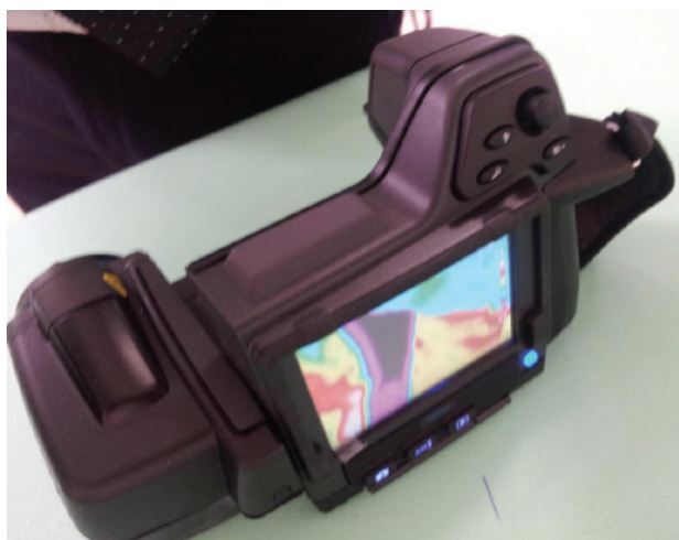
Figure 1. Thermographic camera, T650 sc model (FLIR Systems Inc., Portland, USA) that is used for diagnostic thermography examinations with 620 × 420 pixel definition, and that is capable of detecting differences in temperature with 0.03°C sensitivity.