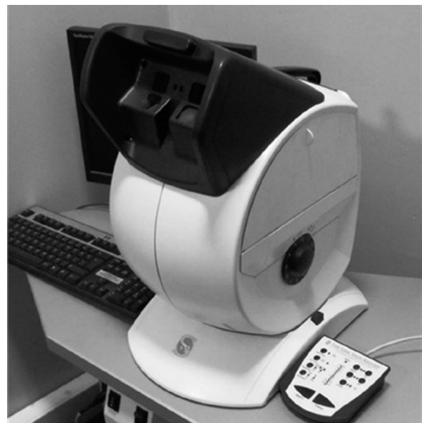
Figure 1. The functional vision analyzer contrast sensitivity test device.

The CS testing device controls light levels with sensors to achieve consistent conditions for each test. This device supplies a target luminance level of 85 cd/m 2 for daytime conditions in compliance with the American National Standards Institute (ANSI). It evaluates spatial frequencies using sine-wave grating charts of 1.5, 3, 6, 12, and 18 cpd. Figure 2 presents the sine-wave gratings charts for the frequencies that the CS testing device used. Contrast was defined according to the Michelson formula ( C = [L_{\text{maximum}} - L_{\text{minimum}}] / [L_{\text{maximum}} + L_{\text{minimum}}] ), C: Contrast, L: Luminance (2) . CS was measured during two sessions separated by at least one week and up to one month (intersession).