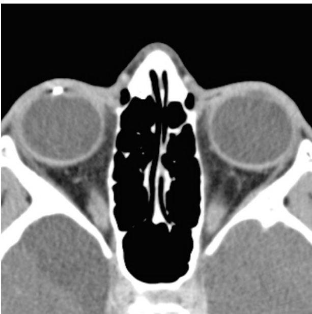
Figure 4. Orbital computed tomography, axial, demonstrating a metallic foreign body in a topography compatible with the inferior cameral angle of the right eye.

trating trauma. In such cases, complications may arise including infection, corneal decompensation, recurrent uveitis, glaucoma, iron siderosis, copper chalcosis, and secondary optic atrophy, cases in which early diagnosis and management are essential for a better prognosis (1,2) .