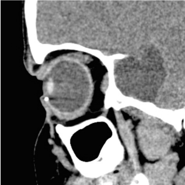
Figure 3. Orbital computed tomography, sagittal, demonstrating a metallic foreign body in a topography compatible with the inferior cameral angle of the right eye.

IOFB is most often diagnosed in the immediate posttrauma period and is treated with surgical removal. However, the IOFB may go unnoticed, and the story may not be enlightening regarding the occurrence of pene-