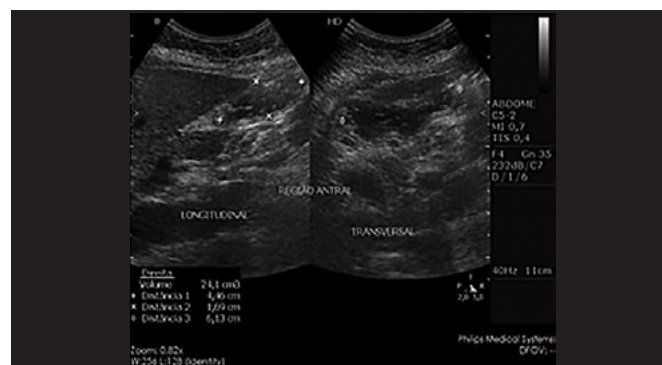
FIGURE 2. Ultrasound images showing the gastric antrum and methodology for calculation of the residual gastric volume.

Residual gastric volume assessment was performed using a Philips model Envisor CHD ultrasound device; all exams were done by the same physician. Participants were positioned in the right lateral decubitus position for 5 minutes, and then an echographic ultrasound examination was done to capture frozen cross-sectional and longitudinal images of the gastric antrum. The antral residual gastric volume was then calculated using a formula to assess the volume of an ellipsoid cavity (longitudinal diameter x transverse diameter x anteroposterior diameter x 0.52). Echographic evaluation of the gastric body and fundus were always performed to assure that all liquid content had flowed into the antral area. Figure 2 shows one example of the echographic image obtained.