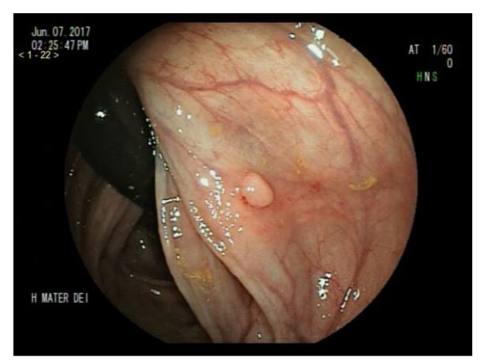
FIGURE 3. Polyp in retroflection.

with adenomas in direct view/total number of patients included) increased from 21.77% to 25% (CI95%, 13.94–42.20 P <0.001). Adenoma miss rate was calculated by the number of adenomas detected in retroflexed view divided by the number of adenomas found (12.8%). If the retroview were not performed, one polyp in every 13.91 colonoscopies would be missed (number of patients undergoing retroflexed view/number of patients with polyp in retroflexed view = NNT=13.91). No adverse event was seen associated with the retroview.