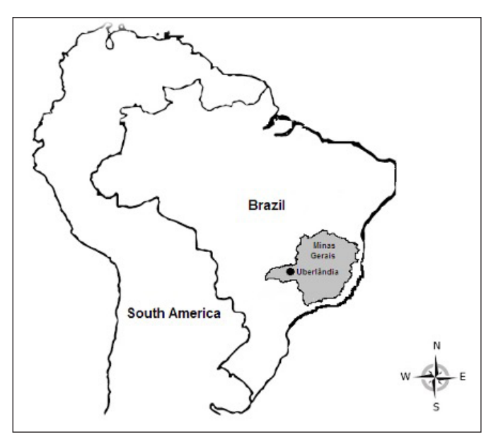
FIGURE 1. Study area: Uberlândia, Minas Gerais State, Southeastern Brazil.

The research was conducted in the Clinical Hospital of the Federal University of Uberlândia (HC–UFU), a reference for medium and high-complexity health care serving patients of the National Unique Public Healthcare System (SUS) in the Triângulo Mineiro and Alto Paranaíba region<sup>(25)</sup>.