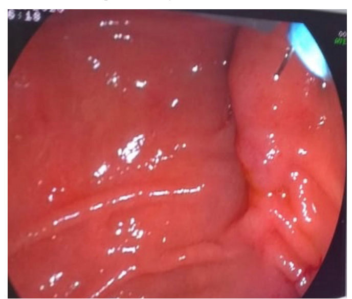
FIGURE 3. Needle knife catheter positioned in the roof of the papilla prior to attempting a nkf procedure.

of 48 hours was performed. Success rate of the ERCP after the short interval was 83.6%, reaching an overall NKF success rate of 96.2%. The success of ERCP after a short interval can be explained due to the improvement of the edema and inflammation<sup>(17)</sup>, that allows better visualization of the site, and a safe and effective biliary cannulation.