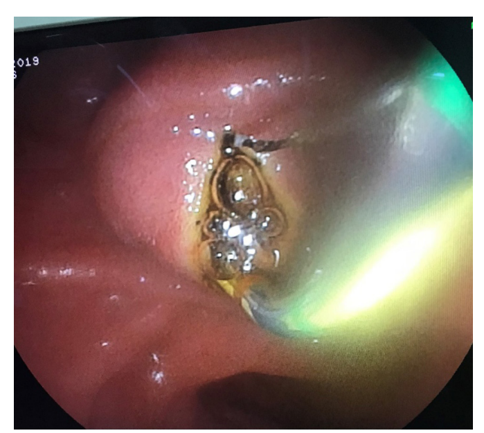
FIGURE2. Classic sphincterotomy.