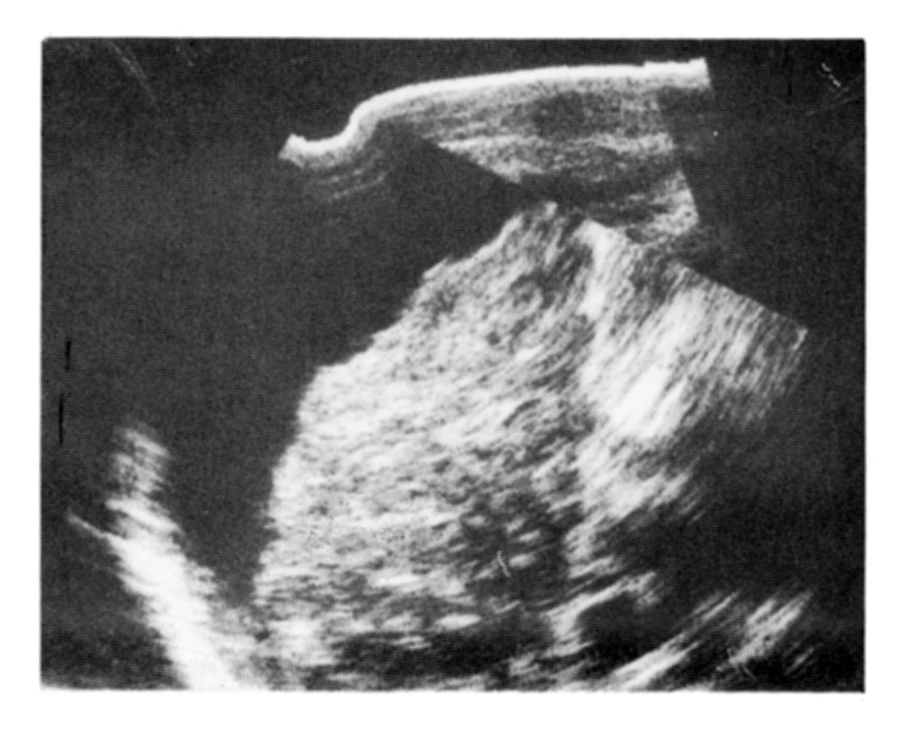
Fig. 2 — Ultrasonographic oblique section of the right costal ridge, showing the presence of ascitis and liver retraction with coarse echotexture and bosselated outline.