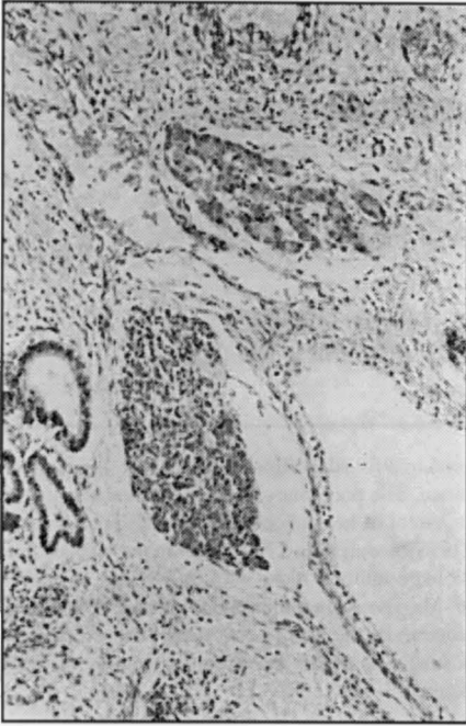
Fig 1. Low power photomicrograph showing liver and respiratory epithelium. H&E, X 40