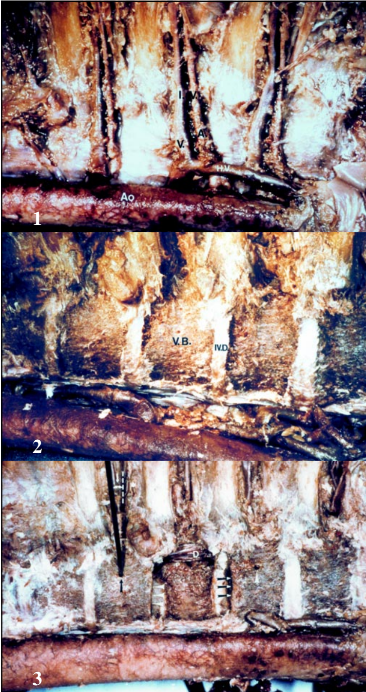
Figs 1-3. Demonstration of the technique using a cadaver specimen. For details, see text. Ao, Aorta; H.V., Hemiazigos vein; I.V.(A;V), Intercostal vessels (artery; vein); IV.D., Intervertebral disc; IV.S., Intervertebral space; V.B., Vertebral body; D, Dura; P, Pedicle; R, Rod (TSRH, Daneke, Memphis, TN); S, Screw(s) (TSRH, Daneke, Memphis, TN.); M.R., Malleable retractor; P.C., Polymerizing cement (Aneuroplastic™ Codman).