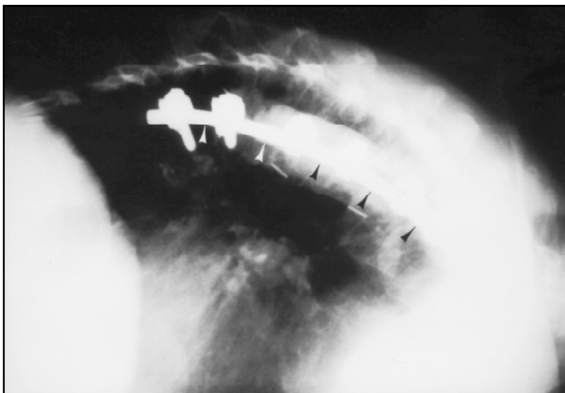
Fig 7. Postoperative X-ray of a patient.