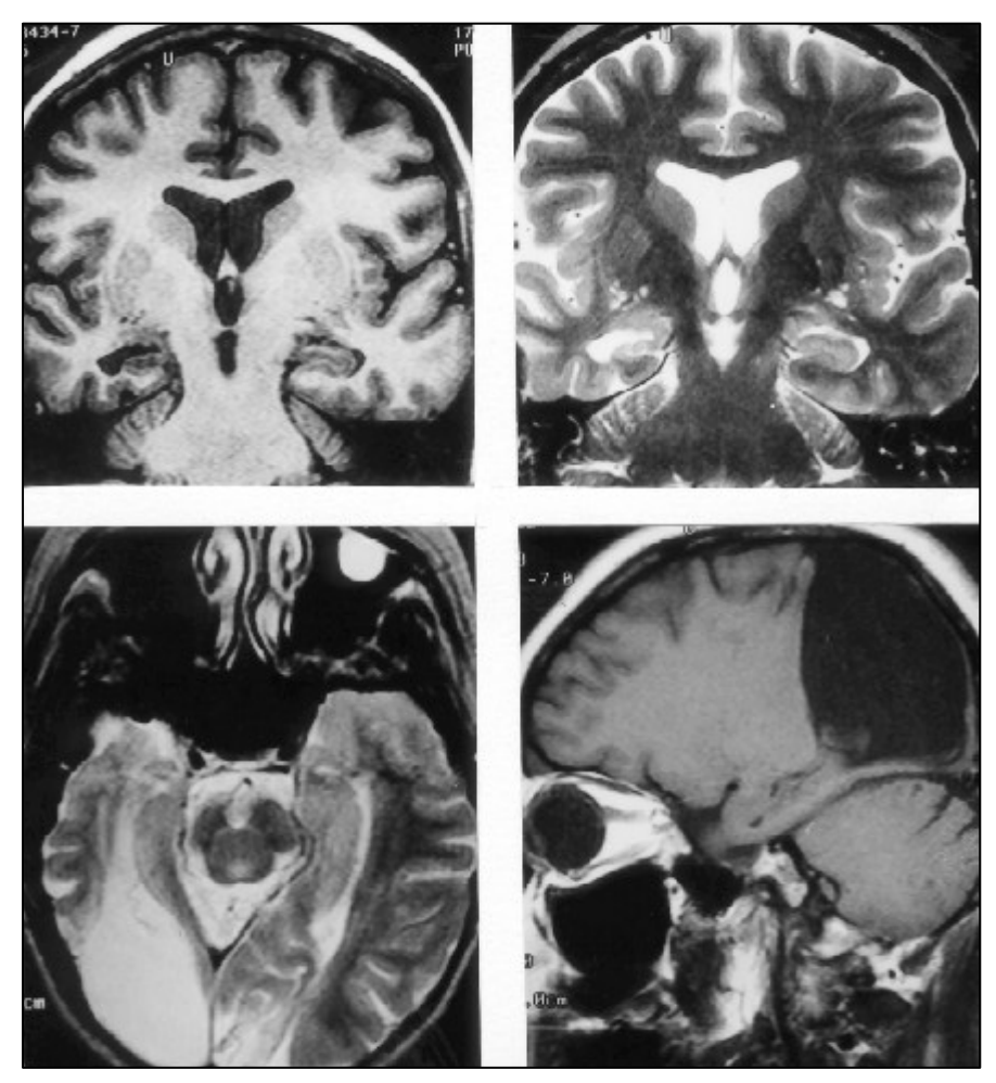
Fig 2. Patient 6. Thirty-eight-year-old woman with intractable seizures since the age of 10. Coronal IR TI-weighted and FSE T2-weighted images (top) showing right temporo-parietal and hippocampal atrophy with hyperintense T2 signal. Axial SE T2-weighted and sagital TI-weighted images (bottom) show the right temporo-parieto-occipital localization of the cysyic lesion, contiguous with the right lateral ventricle.

had consistent interictal activity ipsilateral to the HA. Patient 3 had recorded seizures with bitemporal onsets and voltage dominance contra-lateral to the HA and interictal activity. Surgery was performed ipsilateral to the HA.