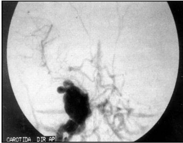
Fig 3. Cerebral angiography revealing the presence of a right carotid-cavernous fistula with retrograde venous drainage through the superior and inferior petrosal sinuses.

noid bone, which produce lesions in the cavernous segment of the ICA. Occasionally however, they may result from iatrogenic injuries, during endarterectomies, rhizotomies, biopsies, among others 2, 3 .