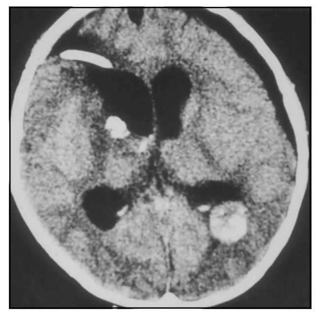
Fig 1. Contrast-enhanced CT scan shows two lesions in ventricular spaces, at right frontal and at left horns, and hydrocephalus.