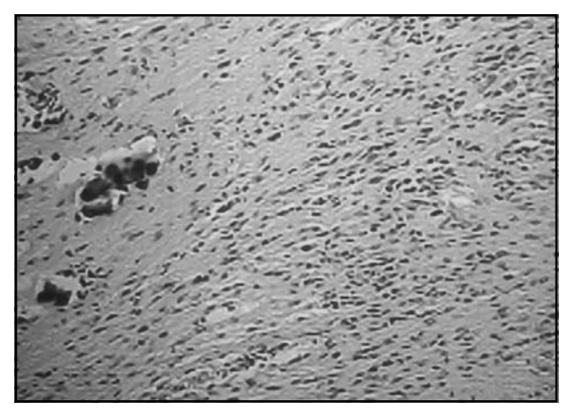
Fig 2. Histological appearance of pilocytic astrocytoma showing fusiform cells with wavy fibrillary processes and Rosenthal fibers.

ged without symptoms. Radiotherapy was proposed but it was refused by her relatives. Four months after discharge, the patient returned with poor general appereance, consciousness impairement, fever, stiff neck and generalized spasticity. CT scan showed diffuse sub-arachnoid enhacement (Fig 3). CSF culture was negative and cytologic examination revealed important pleocytosis with neoplastic cells. Death occured in a few weeks.