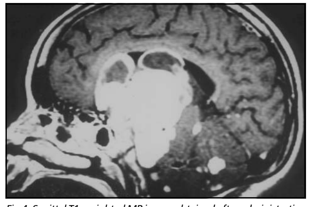
Fig 4. Sagittal T1-weighted MR image obtained after administration of contrast material disclosed a heterogeneous lesion at the optic nerve and chiasm with multiple tumoral implants.

32 cases reported. Incidence of LD of PA is not still determined. Since the use of MRI has become routine in surveying of patients with brain tumors, a sharp increased in number of cases has been noted. Mamelak, analising his series with 90 cases of PA, found an incidence of 12%, including cases of multicentric disease<sup>1</sup>. Gajjar, reviewing low-grade astrocytomas found an incidence of 5,3%<sup>2</sup>. Civitello and associates described 162 patients with low-grade gliomas; six patients (3.7%) had leptomeningeal spread<sup>6</sup>. Pollack found an incidence of 4% of dissemination of low grade intracranial astrocytomas<sup>17</sup>.