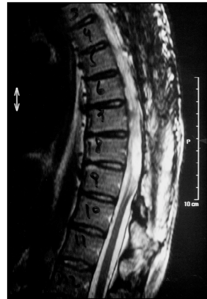
Fig 4. MRI shows the presence of a tumor at the T6 level, and an arachnoid cyst of T7 to T9.

sence of a single case of multiple meningioma, Solero et al. 4 observed only one case of multiple meningioma among 174 cases of surgery for spinal cord meningiomas.