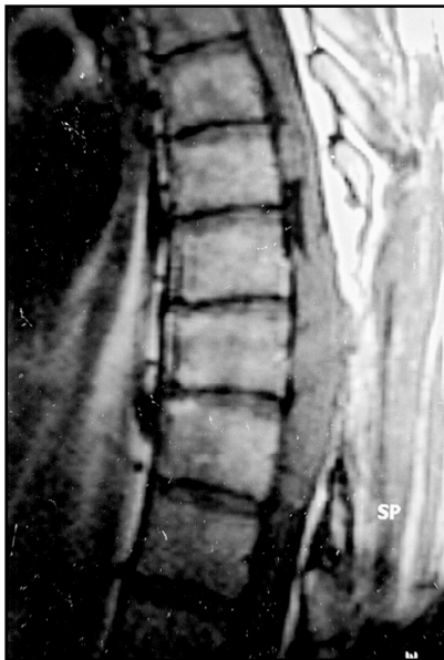
Fig 2. MRI shows a group of tumors that, at first sight, seems to be a stop, but they are really several associated and independent tumors.