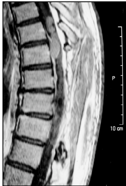
Fig 3. MRI shows two tumors at the T6-T7 level.