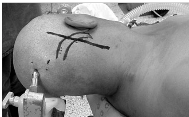
Fig 1. Dorsal decubitus (mastoid) position.

In this study they were included 240 patients (238 with tumors sporadic, unilateral and 2 neurofibromatosis type 2 patients, operated of just one on the sides) operated on dorsal decubitus position (mastoid position) through the retrosigmoid-transmeatal approach (Fig 1). The age of the patients ranged between 16 and 81 years. No difference was observed regarding the gender or the side of the affected ear.