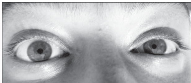
Fig 1. Assymmetric pupils and left semiptosis

veal any rib, sternal fractures or mediastinal enlargement. Skull computed tomography (CT) showed no abnormality so as the carotid ultrasonography Doppler and the angiography of the head and neck. Cervical spine CT showed a fracture of left C7 transverse process and additional investigation with chest CT disclosed a mediastinal hematoma extending to the left lung apex, exhibiting mass effect over surrounding structures without signs of aortic dissection (Fig 2). A conservative management was adopted and the patient left the hospital three days later but still with the neurologic signs. Follow up four weeks after discharge revealed a normal neurologic examination and no complaints.