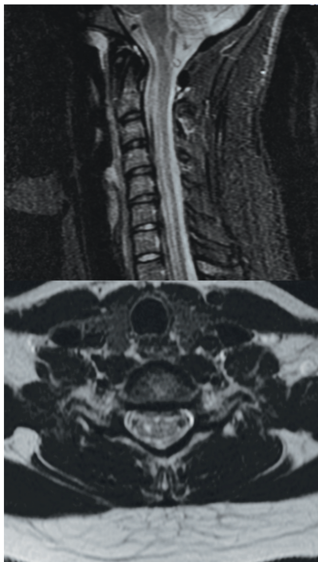
Fig 1. Magnetic resonance imaging showing slight asymmetric T2-weighted hypersignals on the central H region of spinal cord extending from C5 to C7.

Based on these results, acetylsalicylic acid at a dose of 100 mg a day was introduced. Physical rehabilitation was initiated. The patient improved, and a minimal strength deficit and hyperreflexia persisted.