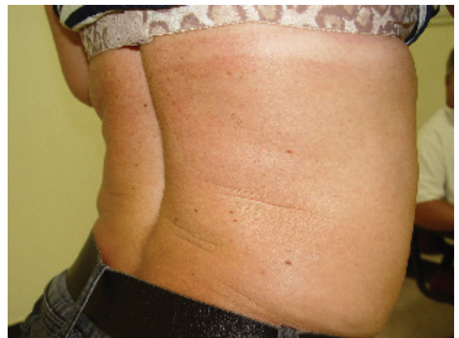
Fig 2. Patient 1 with stiff-person syndrome and contracture and rigidity of the paravertebral muscles (reproduced with patient's authorization).