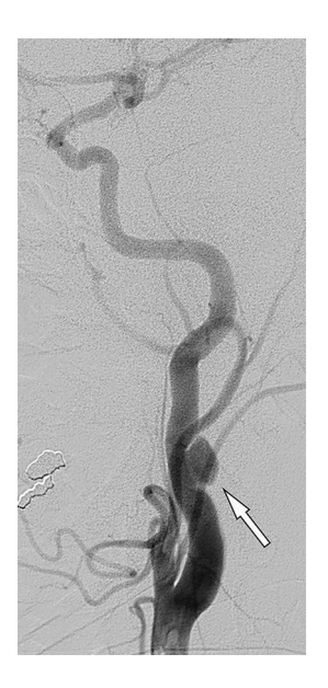
Figure 2. Digital subtraction angiography, oblique view, shows dissection of the proximal left internal carotid artery (arrow). There is an intimal flap and a patent false lumen.