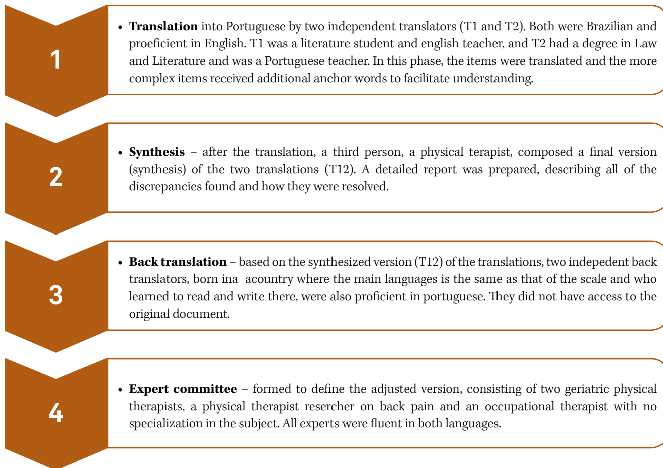
Figure 1. Phases of the semantic adaptation of the Pain Catastrophizing Scale (Beaton et al. 22 ).

the functional tests during one day. After 7 to 10 days, the PCS was applied again by the same examiner to check on the intraexaminer reliability. For the analysis of the inter-examiner reliability, the same instrument was applied to the same individual by two different examiners on the same day. The validity of the construct and the convergence were evaluated and are described below.