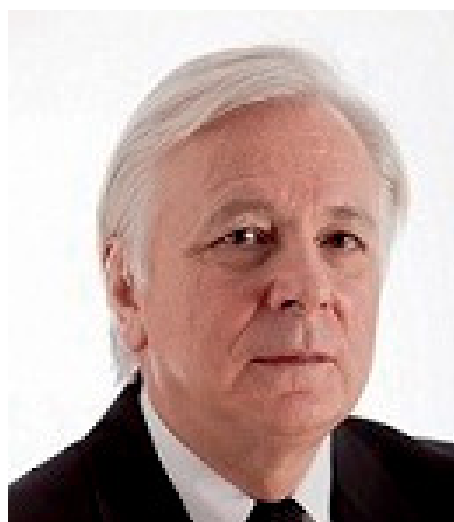
(Reproduced from Google Images: UCL, October 12th, 2016) Figure 5. Professor Andrew J. Lees (1947 - ).

"A soft whistling incantation breaks the silence. Yellow and green iridescent zigzag spectra and indigo and argent helices are under my eyes, ultramarine charges come out of my arms. ...The flashes of beauty intensify as I stagger from the lodge... Phosphenes, coiled floating chains and aerolitos flash above me. Images unwind from the windmills of my mind" 8 .