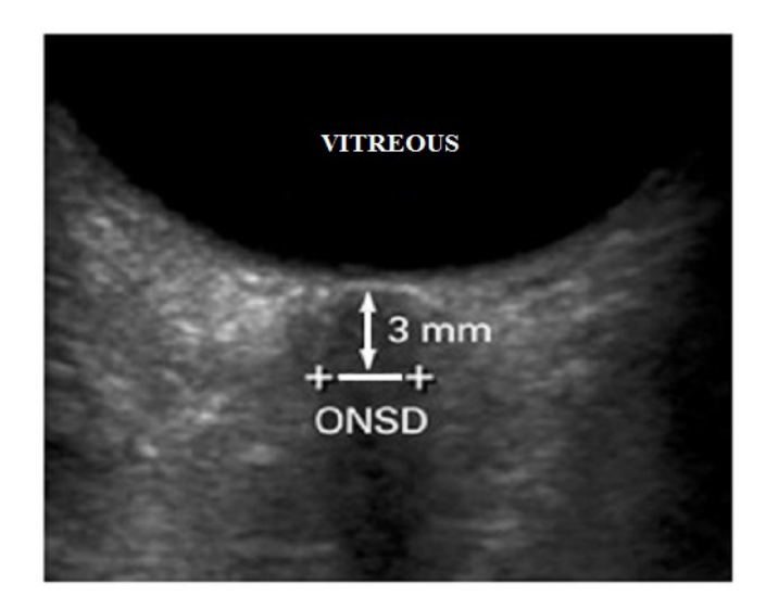
Figure 1. Transverse length of the optic nerve sheath, starting 3 mm behind the optic nerve head.

of optic disc edema and diagnose papilledema. Participants were divided into two groups as patients with IIH and healthy volunteers. Measurements were taken in the supine position using a 10-MHz probe speed real-time ultrasound device (ultrasound scanner model E-Z Scan 5500+ by Sonomed Inc. NY) from the participants in both groups, with the probe placed in the superolateral of the globe with the upper eyelid closed. Only one eye of all participants was evaluated. The optic nerve head was visualized as a linear hypoechoic structure. ONSD was measured three times by the same investigator and the mean value was calculated. ONSD was measured 3 mm behind the optic nerve head (optic disk) as the transverse length of the optic nerve sheath (Figure 1).