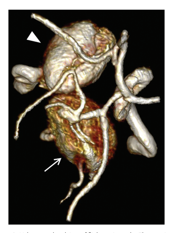
Figures 1 Volume-rendered time-of-flight angiography. The superior view depicts the dissecting pseudoaneurysm of the basilar artery (arrow) and a right internal carotid artery aneurysm (arrowhead).

The authors have no conflict of interests to declare.