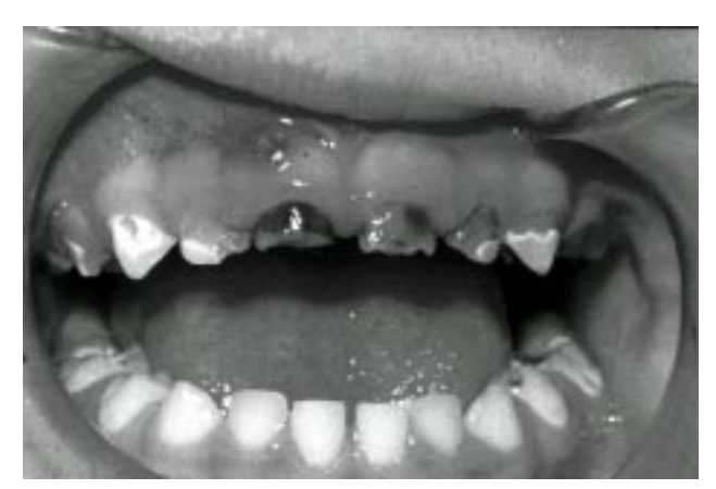
Figure 1 - Typical pattern of carie in infants and preschool children severely affecting upper teeth and lower molars, while lower incisors remain intact. Presence of abscesse in the upper right deciduous incisor..

Caries develops from decalcification of upper deciduous incisors immediately after their eruption, affecting the deciduous molars and canines, if not controlled.<sup>10,11</sup> While the four upper deciduous incisors are the most severely affected by ECC, lower incisors remain intact because they are protected by the tongue and moistened by the saliva from submandibular glands,<sup>10,11</sup> as shown in Figure 1.