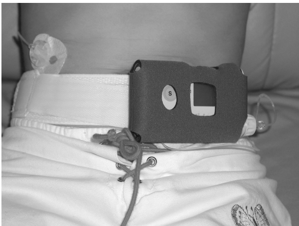
Figure 1 - Insulin infusion pump fitted to the waist of an 11-year-old girl. The subcutaneous cannula can be observed on the left above the belt

Furthermore, the information obtained from the use of continuous glycemia monitoring in research studies can be applied to general practice even if this technology does not become widely available for many years. For example, the clinical experience of some authors with continuous glucose sensors has demonstrated that, in children, postprandial hyperglycemia often lasts for 2-3 h after the meal and that peak activity of a rapid-analog can be combined with the meal when the dose is administered 20-30 minutes before eating. Clinical experience with CGMS has also led to the recommendation of more frequent use of quadruple one double bolus