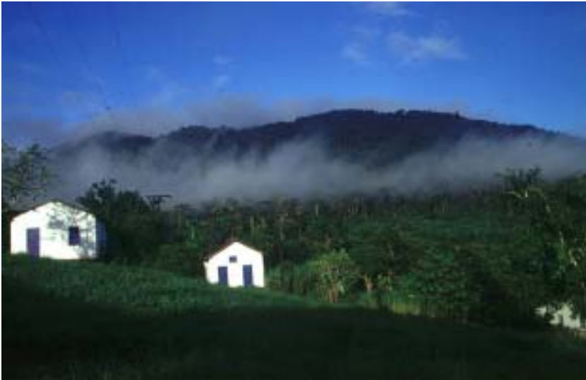
Figure 3. General view of Serra do Teimoso: Jussari: state of Bahia. The primary forests on the top are the habitat of Leposoma nanodactylus , L. puk , and L. scincoides .

Dorsal scales large, strongly keeled, mucronate, lanceolate, and imbricate anteriorly, becoming wider and laterally juxtaposed with almost straight lateral sides at midbody; 28 regular transverse rows between interparietal and posterior level of hind limbs. Lateral scales resembling dorsals but more lanceolate; changing progressively to ventrals except for an area with small, rounded, almost smooth and juxtaposed conical granules around arm level. Groin scales identical to flank scales except for their smaller size. Twenty seven scales around midbody. Ventrals leaf-shaped, keeled, mucronate, imbricate, in 21 regular transverse and diagonal rows from interbrachials (included) to preanals.