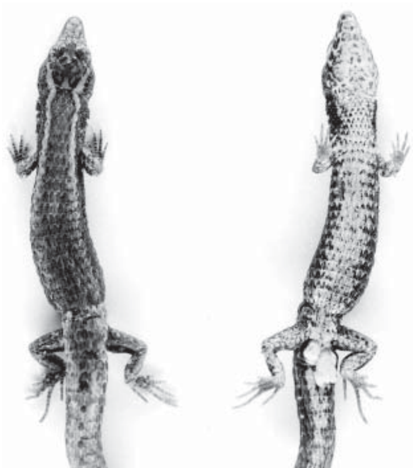
Figure 2. Dorsal and ventral view of a paratype of Leposoma puk (MZUSP 66475) from São José do Macuco.

parent disc formed by two enlarged scales. Temporal region almost all covered with smooth or slightly keeled and juxtaposed scales that are larger around tympanum, around parietals and surrounding postocular area. Lateral surface of neck with conical and juxtaposed keeled granules, irregularly arranged in transversal rows. Ear opening bordered by a series of very small, smooth, granules; tympanum distinct, subvoid. Scales of the top of head with very slight, low relief irregular longitudinal striations; almost smooth when compared to most of other Leposoma .