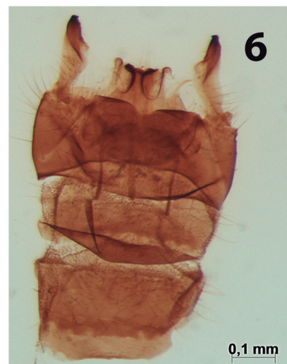
Figures 1-6. (1-2) Bibionellus barrettoi , holotype male, Corumbá de Goiás, Goiás State, Brazil. (1) habitus; (2) male terminalia. (3-4) Bibionellus paulistensis , holotype male, Pitangueiras, São Paulo State, Brazil. (3) habitus; (4) male terminalia. (5-6) Bibionellus paulistensis , paratype male, Porto Cabral, São Paulo State, Brazil. (5) habitus; (6) male terminalia.