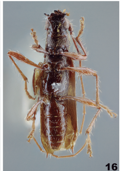
Figures 9-16: (9-12) Eurysthea noqueira sp. nov., holotype, female: (9) dorsal view; (10) lateral view; (11) ventral view; (12) detail of head, dorsal view. (13-16) Eurysthea nakagomei sp. nov., holotype, male: (13) detail of head, dorsal view; (14) dorsal view; (15) lateral view; (16) ventral view.