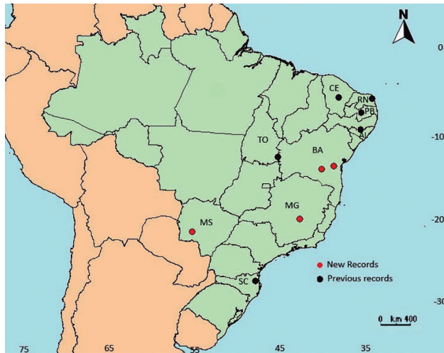
Figure 2. Map of Brazil showing the previously known records (black dots) and the new records (red dots) of Helicina schereri . Abbreviations of the neighboring states: AL = Alagoas; BA = Bahia; CE = Ceará; MG = Minas Gerais; MS = Mato Grosso do Sul; RN = Rio Grande do Norte; SC = Santa Catarina; TO = Tocantins.

Abbreviations: Shell measurements: D = shell diameter; H = shell height; w = aperture width; h = aperture height.