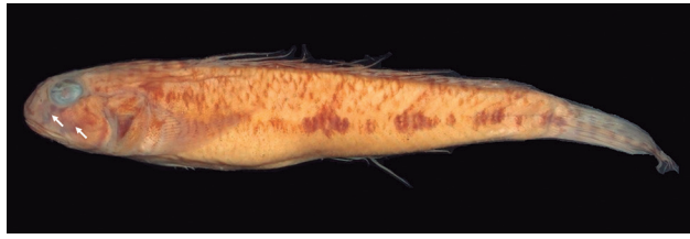
Figure 2. Ctenogobius shufeldti , MZUSP 14346, Rio Grande do Sul, Lagoa de Tramandai, female, 55.3 mm SL, in lateral view. White arrows indicate brown oblique stripes on head below eye that are diagnostic for this species.

15 pectoral rays (vs. 16-20) and presumably less than 14 dorsal fin rays and 15 anal fin rays (vs., respectively, 14 and 15 rays); from G. stomatus by the absence of vertical dark markings on flanks (Pezold, 2004), and from Ctenogobius boleosoma by not presenting humeral black blotch (Ginsburg, 1932; Gilbert & Randall, 1979).