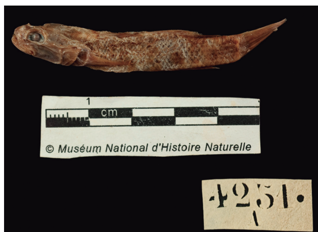
Figure 1. Holotype of Gobius uranoscopus Sauvage. MNHN 251-A, holotype, 57 mm SL, in lateral view.

Other gobiid species assigned to southern Brazilian coast are: Awaous tajasica (Lichtenstein, 1822); Bathygobius soporator , Ctenogobius boleosoma (Jordan & Gilbert, 1882); C. shufeldti (Jordan & Eigenmann, 1887); Evorthodus lyricus (Girard, 1858); Gobioides broussonnetii (Lacépède, 1800); Gobionellus oceanicus (Pallas, 1770); and G. stomatus (Starks, 1913) (see also Fischer et al. , 2011; Malabarba et al. , 2013). Gobius silveiraemartinsi differs from Awaous tajasica by having larger eye (25% of HL vs. less than 20% of HL), more than 11 anal fin rays, and pigmentation without black oblique lines behind the pectoral fin base (present in Awaous ; Watson, 1996); from Evorthodus lyricus by the absence of two round black blotches on the caudal fin base (present in E. lyricus ; Murdy & Hoese, 2003); from Gobioides broussonnetii by having large eye (about 25% HL vs. 5% or less; Murdy, 1998); from Gobionellus oceanicus by possessing about