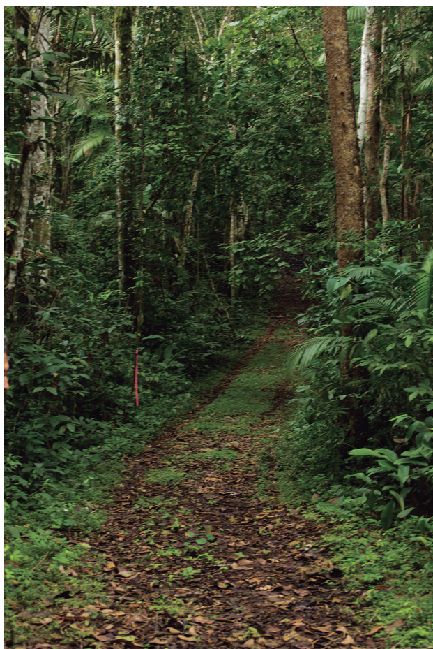
Figure 1. Atlantic Rain Forest in Reserva Ecológica Michelin, Vila 5.

Material examined: 1 male, BRAZIL, Bahia, Serra da Jibóia, Sede Gambá, 10.v.2017, Ligth [trap], Silva-Neto, Mendes & Moura, leg. (MZFS).