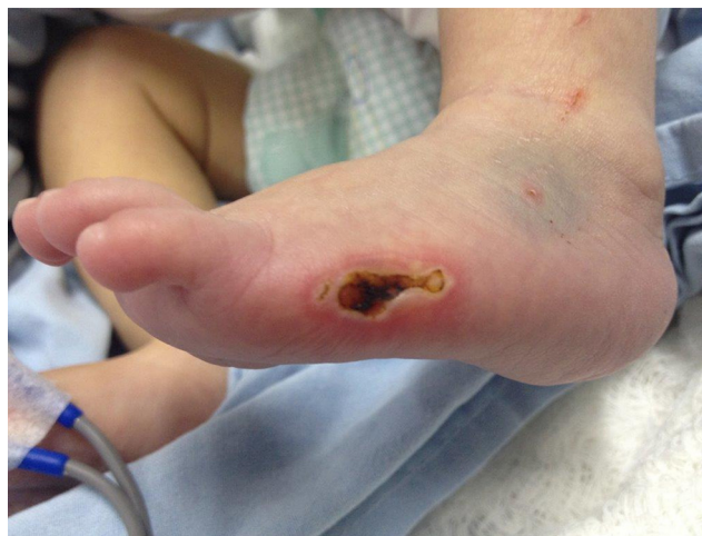
Figure 1 Third degree burn at the dispersive plate site.

Male patient, 30 years old, physical status ASA II due to smoking, reported a prior history of ureterolithiasis. Had undergone implantation of double-J catheter few months before and was scheduled for its withdrawal