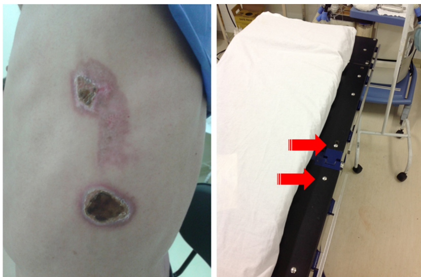
Figure 2 Burning in the flank region (left); and surgical table exposing the metal parts coincident with the burning formats (arrows).

endoscopically. After standard monitoring, subarachnoid anesthesia was induced by a first year resident, with supervision. T10 sensory level was achieved, and the patient was placed in the lithotomy position. However, due to the long-term catheterization, the catheter withdrawal was not possible as scheduled by the surgical team and there was the need for abdominal approach through suprapubic incision. The patient was then repositioned on the surgical table to a supine position. Monopolar electrosurgery was used, with a disposable dispersive pad placed on the back of the patient. During the intraoperative period, the patient complained of pain in the left side of his back, which was not investigated by the anesthesiology resident. The patient was taken to the post-anesthesia recovery room and was discharged the next day—there were no complaints reported in the hospital records. A month after the incident, he went to the Anesthesiology Clinic for a consultation on further urological procedure and, during the anamnesis, reported the occurrence of burn on his left flank during the procedure previously mentioned. Upon analyzing the injury shape, it was found a similarity with the contact metals of the operating table (Fig. 2). Thus, it was concluded that the burn was caused by direct contact of the patient with the table metallic part. The patient was referred to the plastic surgery department of the institution for clinical management.