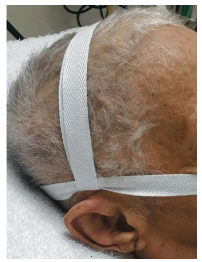
Figure 1 - Helmet technique for orotracheal tube fixation

The rotation of the labial commissure for OTT was also pointed out in a Brazilian study<sup>(20)</sup>, in which 40% of the interviewed nurses considered this care as the most important to avoid injuries and oral fissures associated with the device. Supporting this, a study carried out<sup>(21)</sup> in the United States showed a reduction in the prevalence of OTT-related injuries from 16% to 10%, when the repositioning of this device was performed every 4 hours instead of every 12 hours.