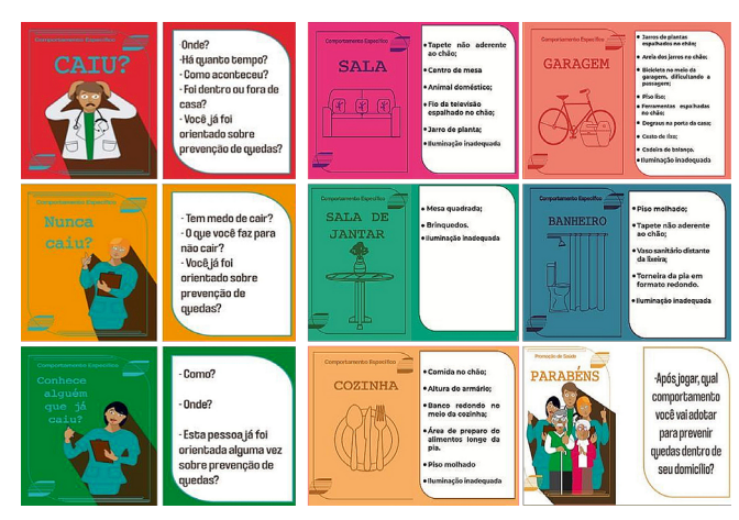
Figure 3 - Same cards according to the characteristics of Nola Pender's Health Promotion Model

Regarding fall history, 16 (51.61%) had fallen in the last 24 months, 24 (77.41%) had never been hospitalized for falls and 12 (38.70%) had sequelae after falls, such as shoulder and knee pain. When asked about falls prevention guidelines, 20 (64.51%) received and these were from nurses or nursing students.