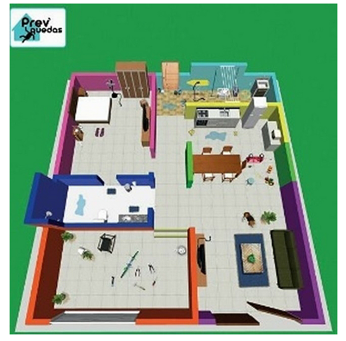
Figure 5 - Final version of the educational game