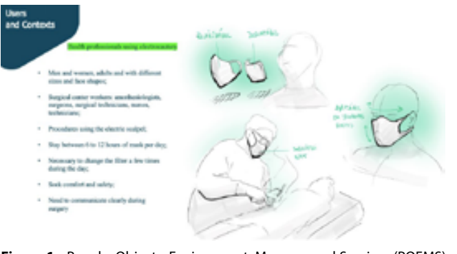
Figure 1 - People, Objects, Environment, Message and Services (POEMS) tool for use in the development of surgical smoke protection mask

In the previous steps, the context and users' understanding were discussed, obtaining knowledge and information about the object of study, after which the Frame Insights phase began, where the collected information was understood, transforming it into useful and concrete interpretations for prototype development. Based on this information and analysis of the requirements listed for developing the prototype, the Explore Concepts phase was started, where the project solutions were defined, and then proceed to product creation. It is the phase known as ideation, which is the moment when the team creates ideas centered on users and on the context studied in the previous steps<sup>(12)</sup>.