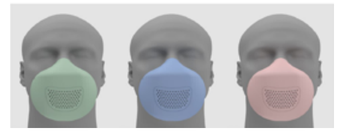
Figure 4 - HeLP, a mask for occupational respiratory protection for workers exposed to surgical smoke