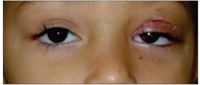
Figure 4. Under-correction of left ptosis 15 days after resection of the LPS aponeurosis.

The most common complication is under-correction (10-15% of cases), which can result from improper resection, incorrect identification of structures, excessive scarring, or improper suturing (6,7) (Figure 4). Over-correction results in incomplete eyelid occlusion and is a rare complication of congenital ptosis correction, but it can occur when the eyelid is sutured to Whitnall's ligament or when the orbital septum is excessively shortened. (7) Although it is desirable postoperatively, symmetrical eyelid height can expose the cornea, therefore it is recommended that a Frost