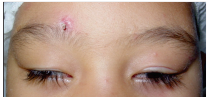
Figure 5. Reaction to silicone with a local inflammatory process and partial exposure of the material.

Eyelash ptosis, entropion and excessive skin folding can also occur. Fixation of the fascia to the lower tarsus creates an anterior torque on the eyelid margin and reduces the risk of entropion, but it can lead to a euryblepharon-like opening of the margin. Creating an eyelid crease is also important. In order to prevent skin folding, excessive skin should be removed as appropriate. (16)