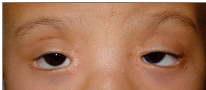
Figure 3. Blepharophimosis. Note the marks of epicanthus inversus correction. Severe ptosis with arched eyebrows, reduced horizontal fissure, and euryblepharon.

Even in successful cases, blepharophimosis patients retain a typical facies with narrower palpebral fissures.