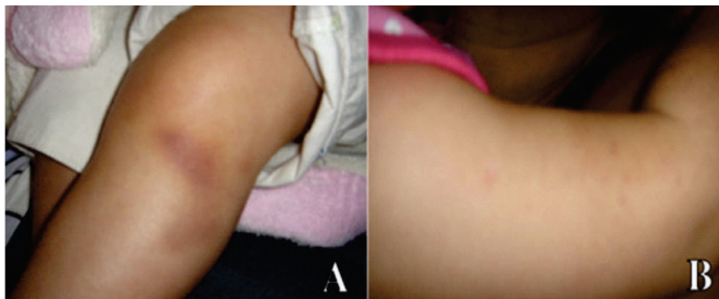
Figure 1: A – Hematoma of the left leg; B – Petechiae on the right arm

During the first examination, the child appeared to perceive an object at a distance of less than one meter with the right eye and could detect only hand movements with the left one. Neurological examination revealed developmental delay. She presented with bilateral leukocoria, and her digital ocular pressure was normal. Fundoscopy of the right eye revealed preretinal hemorrhage, coarse vitreous floaters, and no signs of disruption. The left eye exhibited a previous diffuse vitreous hemorrhage and vitreous floaters. Dermatological examination revealed petechiae in both legs and arms (figure 1).