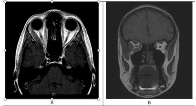
Figure 2: Orbital magnetic resonance (a)- axial T1 fat sat and (b) coronal T1 fat sat showing: enlargement of all four rectus muscles at right.

A visual field was performed and was within normal range. An orbital magnetic resonance (MRI) was done and showed an increase of volume of all 4 rectus muscles of the right eye and muscle oedema (with low intensity on T1-weighted images) as seen in figure 2.