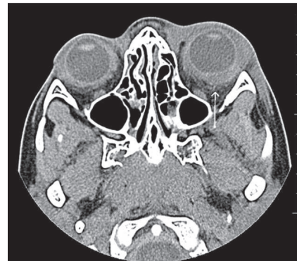
Figure 2: Computed tomography. Images in axial cuts with visualization in window of soft parts. Lesion of the soft parts of the pre- and post-septal space with involvement of the intra-conal space and involvement of the left orbital musculature determining a light proptosis of the ocular globe compatible with the inflammatory process.

may correspond to the inflammatory process depending on the clinical correlation (Figure 2).