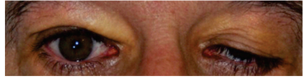
Figure 1: . Clinical appearance of the eyelid lesions and ptosis of the upper eyelid of the left eye.

for correction of ptosis of LE. With continuous treatment, it evolved with the cure of diplopia and without other clinical forms of the disease.