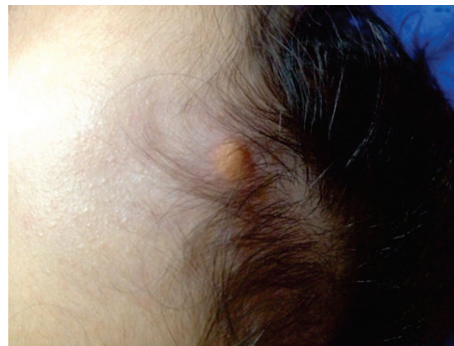
Figure 2: Juvenile xanthogranuloma in the scalp

Four months after first visit, typical yellowish papules at the face and scalp were observed (Figure 2) and since iris lesion improved significantly (Figure 3) dexamethasone weaning was started. One month later, patient returned with worsened lesion in the right eye (Figure 4). New cycle of topic dexamethasone with weakly weaning and systemic prednisolone 1mg/kg/day were started. After improvement of iris lesion, systemic prednisolone weaning was also started. When finishing medications, lesion worsened once again, this time prednisolone 1% drop was prescribed, initially, once a day following by alternate days therapy, which was maintained since lesion apparently stabilized.