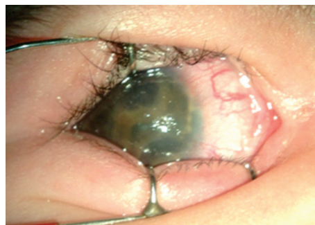
Figure 4: Worsening of iris lesion after suspension of topic steroids therapy