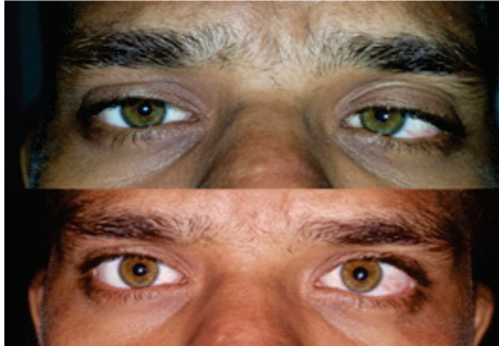
Figure 2: Patient before the intervention and after the surgical procedure

No residual vertical deviation in the late postoperative period was observed in any of the six patients submitted to the Johnston-Crouch et al procedure (Figure 2). Subjectively, five patients reported improvement of the field of view without diplopia, perceiving it only in extreme versions, only the patient with great preoperative deviation presented diplopia in PG.