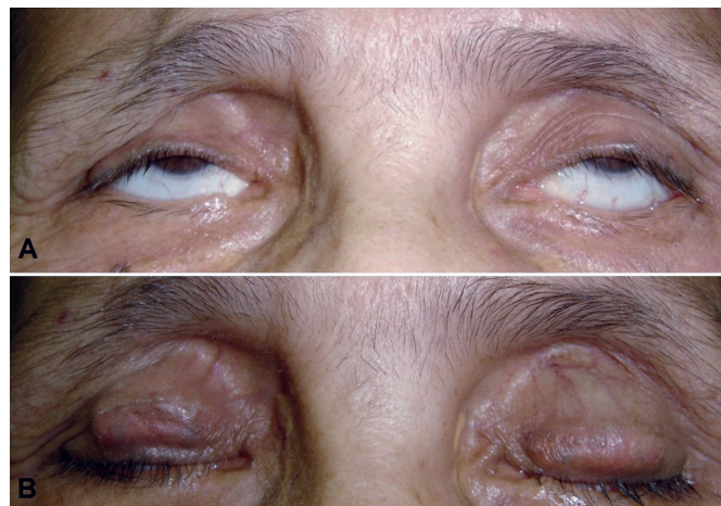
Figure 3: Bilateral lagophthalmos in a leprosy patient who underwent surgical correction using the gold weight implantation technique. A.: preoperative in an attempt of eyelid occlusion; B.: postoperative with corrected bilateral lagophthalmos