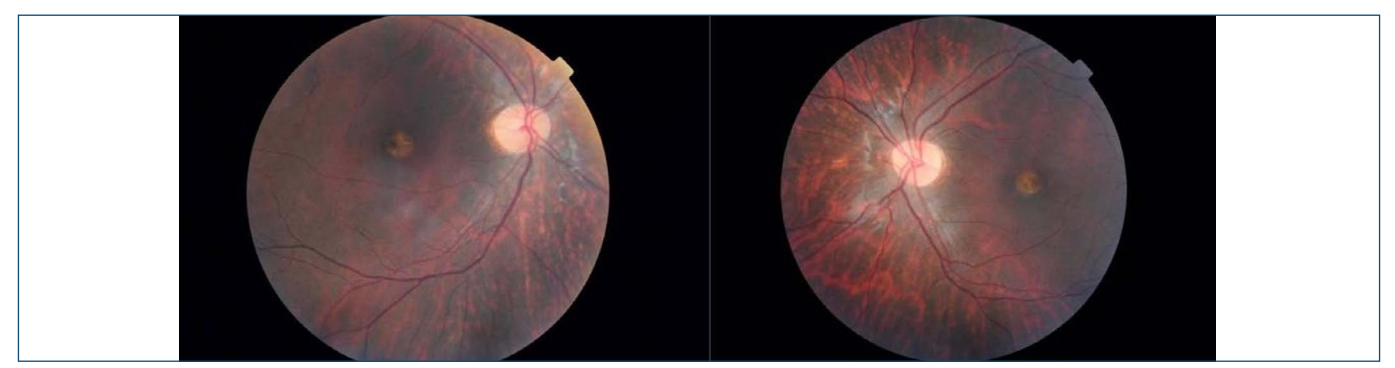
Figure 3. Fundus photo showing symmetric, round, grey-yellowish lesions in the foveal center of each eye.