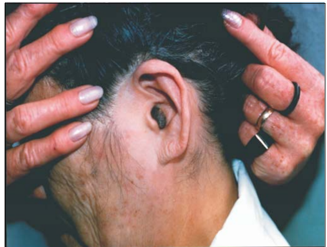
Photo 1. Intradermal melanocytic nevus.

As to histopathology 3 , in childhood, 90% of the nevi show melanocytic proliferation on the dermoepidermal junction forming nests of nevus cells (junctional nevi). Later, nevus cells migrate to the dermis to form nests and cell columns (compound nevi). Nevus cells may extend deeply around more superficial neurovascular appendices and structures, maintaining the initial characteristics such as