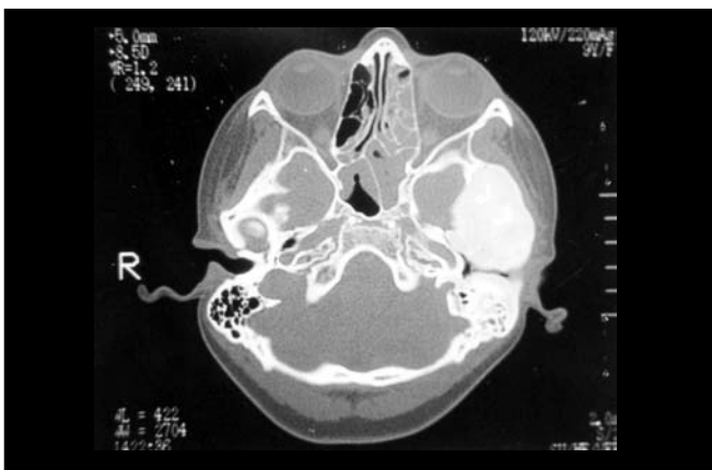
Photo 5. Temporal bone CT scan (axial section) of a patient with fibrous dysplasia of temporal bone on the left, as differential diagnosis. Note the spongiotic bone.

addition to impairment of facial nerve canal. The presence of exaggerated increase of bone with rarefaction of medullary cavity supports diagnosis 2 . In the patient affected by Camurati-Engelmann disease, initial symptom related to temporal bone affection was slowly progressive hearing loss. What attracted our attention and made the patient come for medical care was facial palsy, which evolved to bilateral presentation within one month, considering that there was delay between the first manifestations of facial nerve involvement and the first visit (2 months), which worsens prognosis when it comes to compression the nerve or narrowing of canal. The first manifestations of the disease are normally in long bones, but we should be attentive to the possibility of having temporal bone affection so that treatment can be started as early as possible.