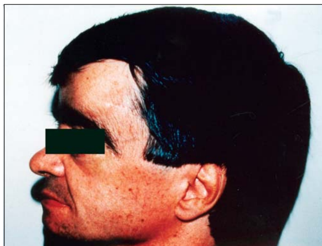
Photo 2. Case 2: patient aged 48 years, male, with progressive osteopetrosis. Note anterior-posterior widening of skull.