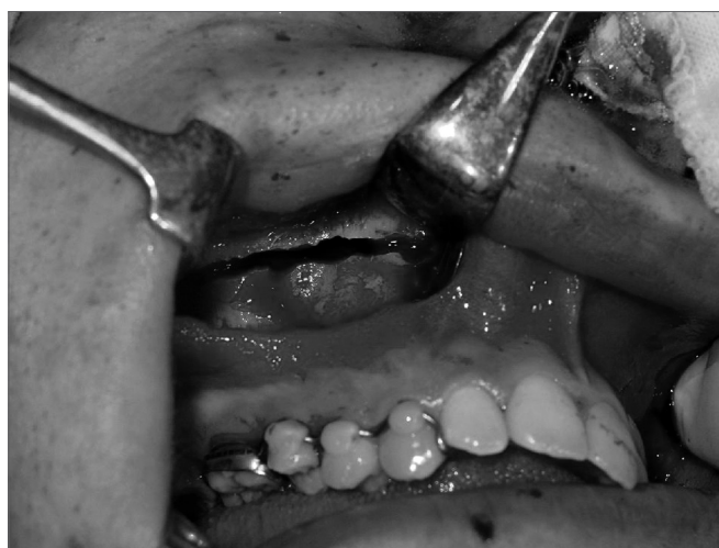
Figure 2. Osteotomy of the anterior and lateral maxillary walls.