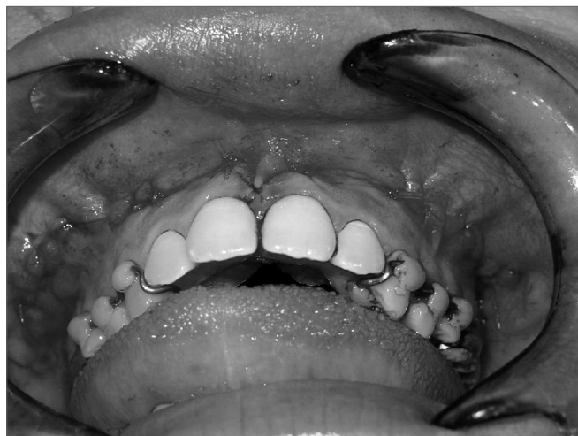
Figure 4. Immediate postoperative.

the lateroinferior region of the piriform opening to the zygomatic pillar. The pterygoid process was separated or not according to the group of patients. The intermaxillary region was separated between the central incisors with a fine osteotome. The surgeon placed his second finger over the incisor papillary region to feel the surgical tool as it was passed through the palatine suture. This same surgical tool was also positioned and manipulated in the interradicular region of the central incisor to obtain symmetric maxillary mobilization. An orthodontic device (Hyrax) was activated at 1mm. No expansion was made during the first seven days postoperatively in both groups. After this initial period, patients applied a quarter-turn once a day until the planned expansion was reached.