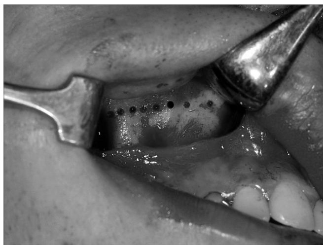
Figure 1. Osteotomy of the anterior and lateral maxillary walls.

Preoperative and 30-day postoperative anteroposterior cephalometric radiograms assessed the upper and lower zygomatic planes and the intertuberal distance. An occlusal radiogram assessed the intermaxillary disjunction preoperatively and at 30 days postoperatively. Surgery was done under general anesthesia and associated local anesthesia with a vasoconstrictor solution in the labiobuccal vestibule. A horizontal mucoperiosteal incision was made 3mm above the mucogingival junction from the canine to the second molar tooth. A horizontal osteotomy was made on the lateral maxillary wall 4 to 5mm above the tooth apex on level with the occlusal plane and extended from