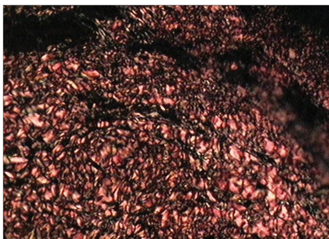
Figure 2. Vocal fold dyed by the Sirius Red solution after polarization. Notice the birefringent aspect: mature collagen with reddish orange dye and non-collagen substance dyed dark.