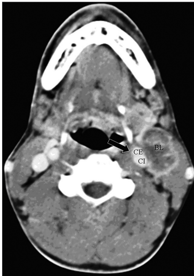
Figure 3 - axial CT (4 sequential sections) with endovenous contrast. High jugular-carotid (level II) lymph node block (BL) to the left with signs of rupture of the capsule and a contact interface over 50% of the internal carotid artery circumference (arrow).

In those cases that presented bilateral lymph node involvement, "n" was doubled, considering both sides (right and left) as separate samples. The statistical software was the EPIDAT, version 1.0, 1994, Junta de Galicia, PAHO.