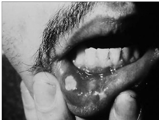
Figure 2. Aphtha major on the lower lip. Notice scar lesions

Lehner 15 and Sistig et al. 4 advocate the thesis that RAS's physiopathology is associated with a disorder in immunomodulation. These authors did not find positiveness in the direct immunofluorescence test (Dif) in patients